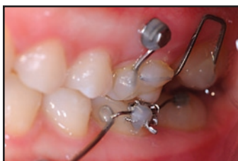
106 Crossbite Correction